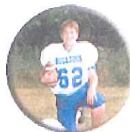
I 3" Photo Button Save when you buy 2! $9.00 or 2 for $12.00