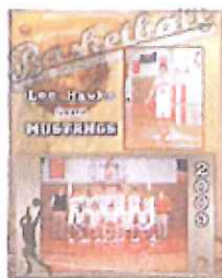
F 8x10 Combo Print Perfect for framing! $13.00

Additional Prints: $12 each → A 1 - 8x10 • B 2 - 5x7s • C 4 - 3½x5s • D 8 - wallets $15 → E 10x13