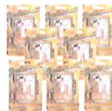
J 8 Laminated Bag Tags Includes 8 Plastic Cords! $14.00

Bonus Items are not available unless added to a package