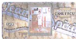
H 3x6 Mini License Plate High Gloss Thick Plastic $16.00